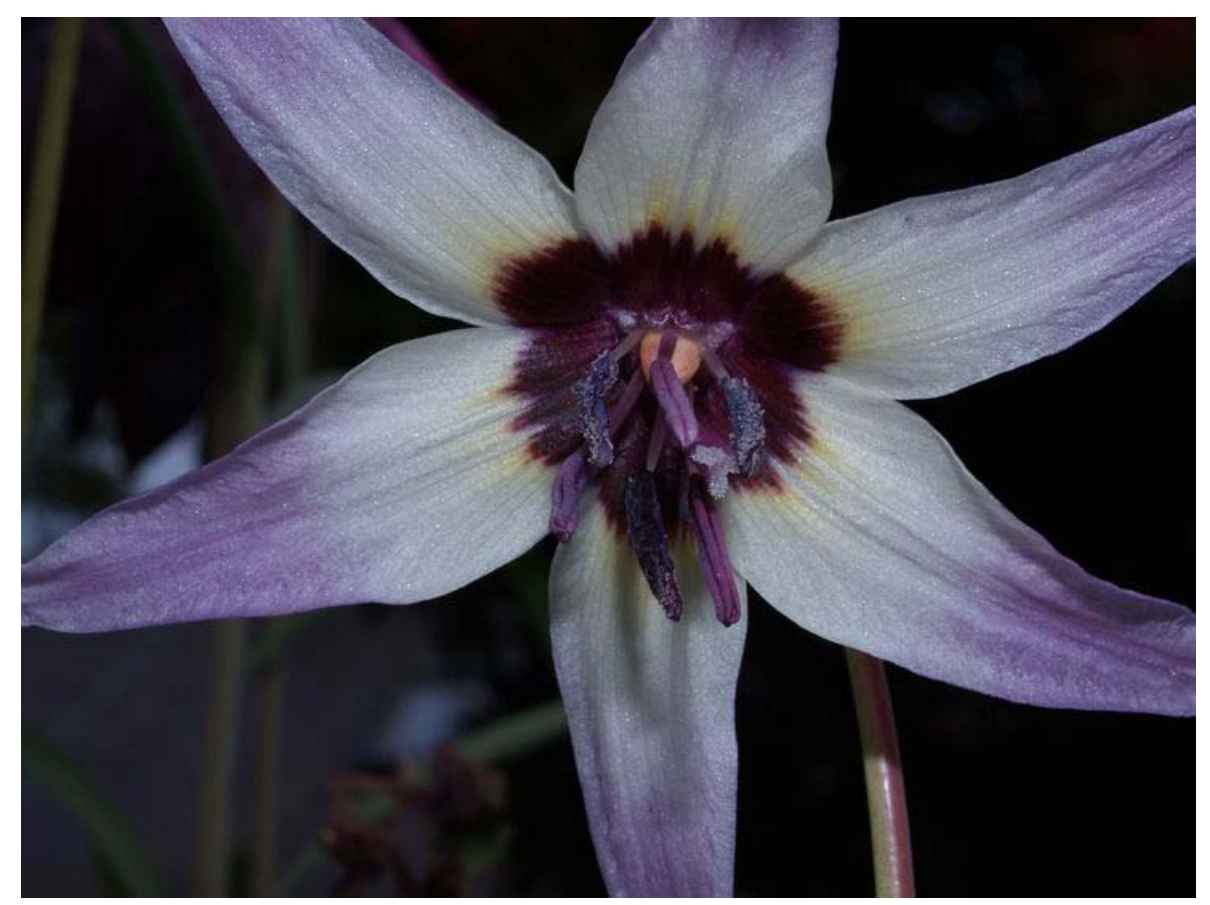
Erythronium hendersonii hybrid

Now notice that this flower has the same basic colour zones but there is some yellow appearing at the transition zone between the dark throat and the petals – this is a sign of hybrid genes. These hybrids can make very fine garden plants because the hybrid vigour sometimes also brings the ability to form clumps quite quickly.