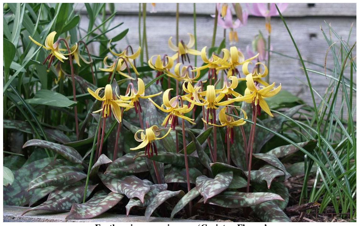
Erythronium americanum 'Craigton Flower'

I named a selected form of Erythronium americanum 'Craigton Flower' as it flowers well every year and, from all the keys that I have access to, it seems to fit in as Erythronium americanum.