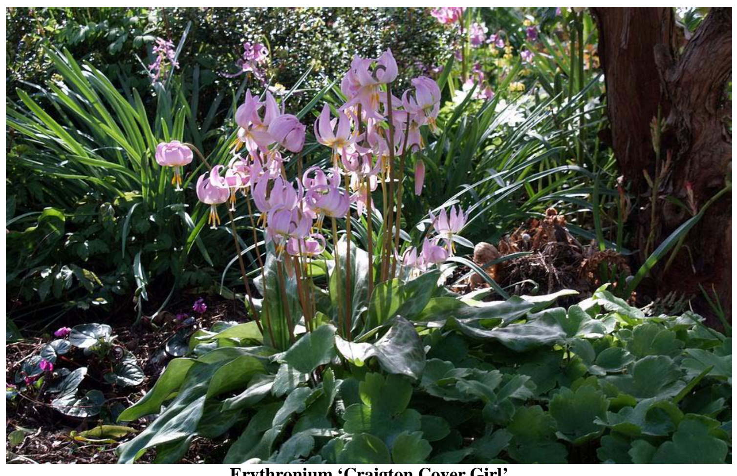
Erythronium 'Craigton Cover Girl'

These are the plunge frames where many of the seeds that produce the hybrids come from .Below is the best garden worthy hybrid that I have raised because it is both a fine plant and a generous increaser E. 'Craigton Cover Girl'.