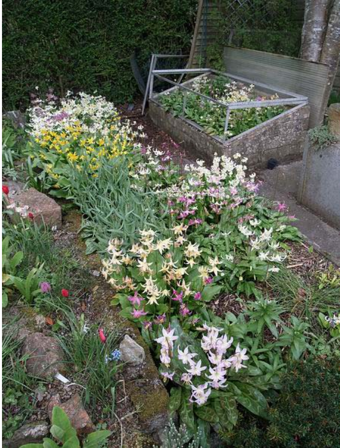
The bed above has fourteen plunge baskets of Erythronium species growing happily in an area 180 cms by 45 cms.