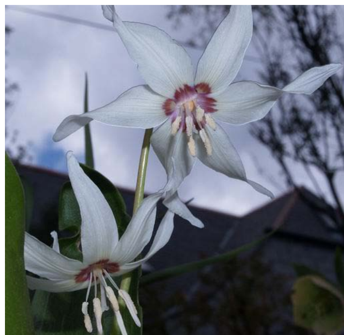
Erythronium hendersonii hybrids

These are a few more of the Erythronium hendersonii hybrids that have appeared in our seedlings most retain some degree of the dark blackcurrant colour in the centre but as you can see the anther colour can vary depending on the other parent.