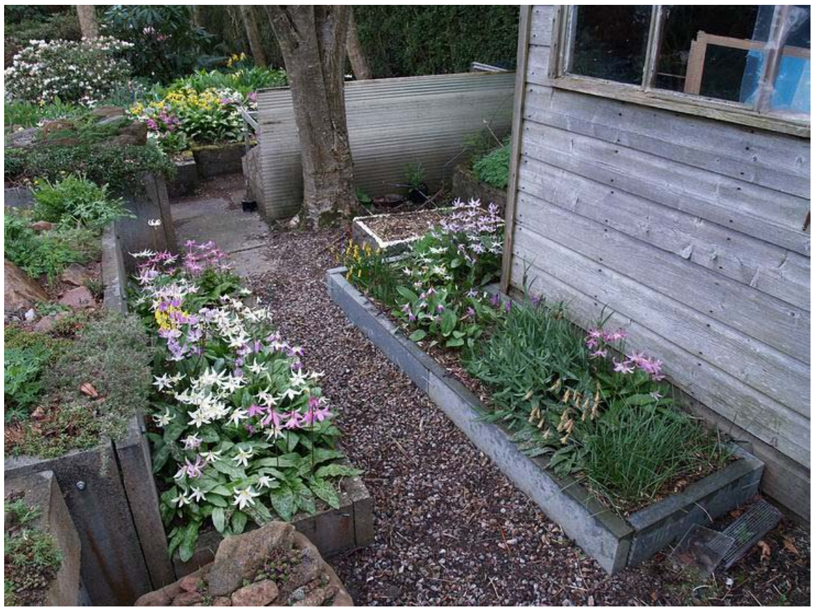
Erythronium plunge frames

I named a selected form of Erythronium americanum 'Craigton Flower' as it flowers well every year and, from all the keys that I have access to, it seems to fit in as Erythronium americanum.