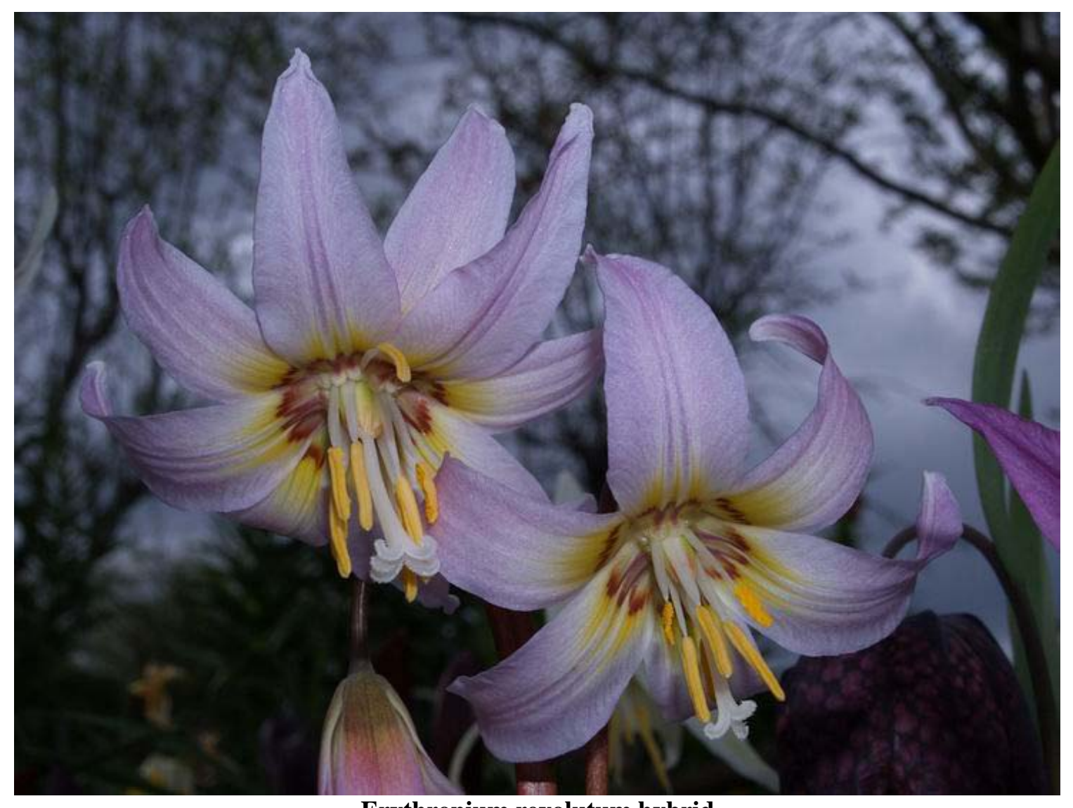
Erythronium revolutum hybrid

Another species that produces a number of hybrids is Erythronium revolutum and I am showing just a few of the many we have here. Unfortunately they do not all increase well so no matter how attractive they may be they will never be produced in large enough numbers to become wide spread. Also notice that the flower on the left has extra petals, stigma and that the style is divided into five not three branches at the end – not an attractive feature in my view.