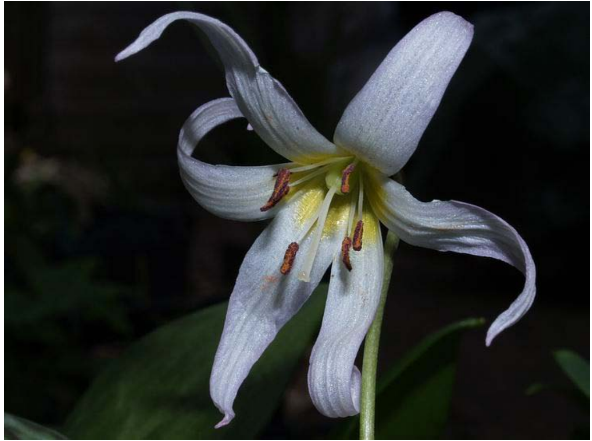
Erythronium citrinum subsp. roderickii

Not a first flowering of this subspecies but the first flowering from my own seed of this beautiful Erythronium citrinum subsp. roderickii distinguished by the brown pollen on the anthers.